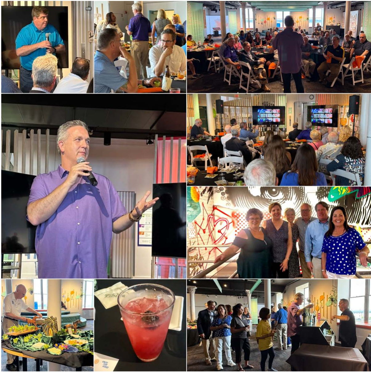
Several attendees took time, despite the heat, to visit the Louisville Knot and learn about our club's effort to bring unity to our city.